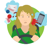
Less naturally mindful drivers