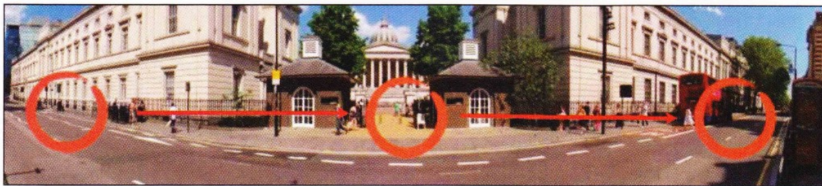
Saccades - you see the red circles only and your brain fills in the rest of the detail

Not convinced? Okay, go to a mirror and look repeatedly from your right eye to your left eye. Can you see your eyes moving? You cannot. Now have a friend or partner do the same thing while you watch them. You will see their eyes moving quite markedly. The reason you couldn't see your own eyes move is because your brain shuts down the image for the instant that your eyes are moving. Experiments have shown that it is impossible to see even a flash of light if it occurs within a saccade.