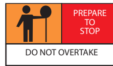
Traffic controller sign with prepare to stop sign