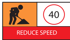
Reduce speed sign with roadworkers sign